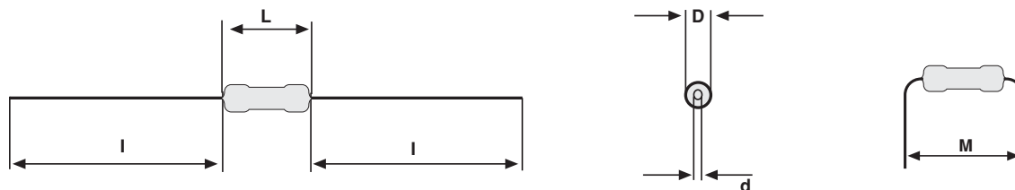
DIMENSIONS - leaded resistor types, mass and relevant physical dimensions